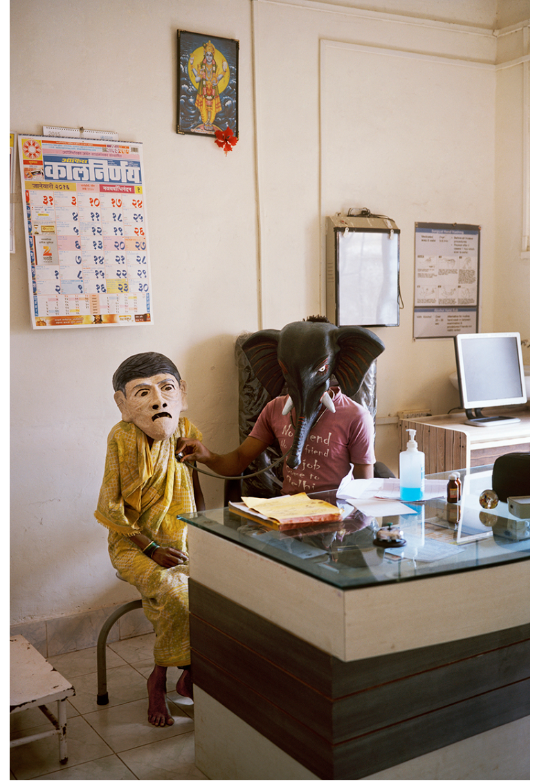
Untitled, from Acts of Appearance (2015-).

The multiple identities of the elephant-man in these photos is typical of Acts of Appearance. It is indicative of Gill's engagement throughout the series with representation, identity and role-play. "We are all constantly changing beings, as many different selves as moments in time," Gill said. "And others read us in their own subjective ways, perhaps different from how we imagine ourselves to be."